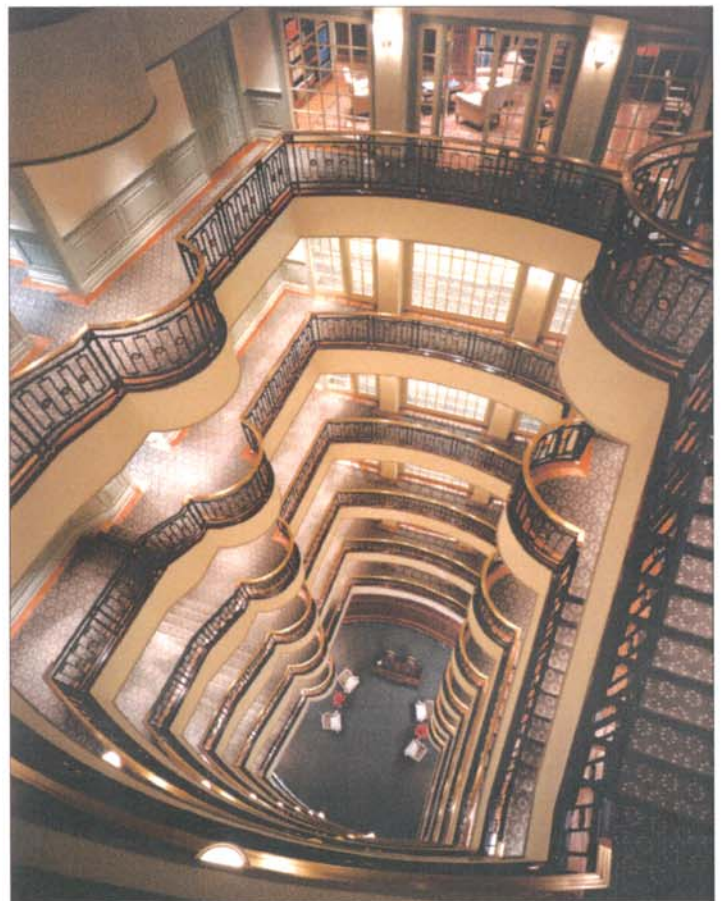
Photo of Cadwalader's famous atrium and stairway.