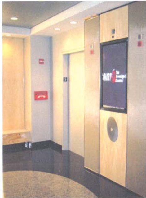
Court TV's new "virtual receptionist"